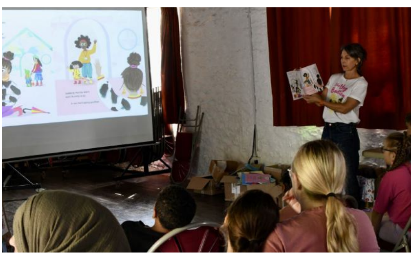
Meet the Author and much more...