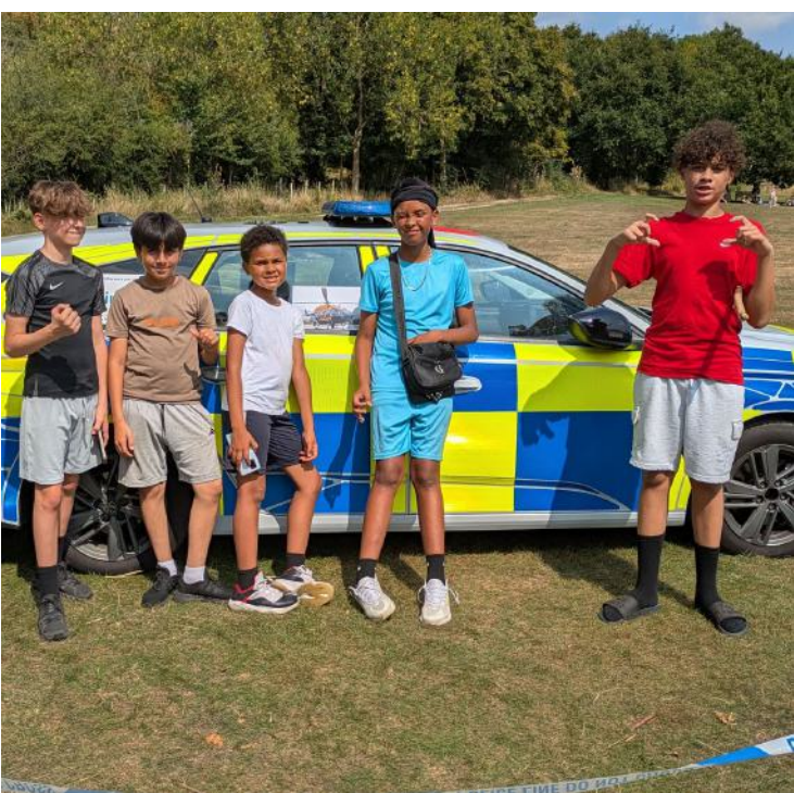
Police car Q&A + demonstration