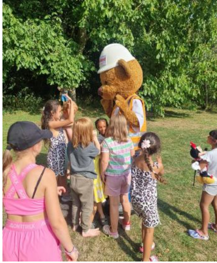
Teddy Bear's picnic