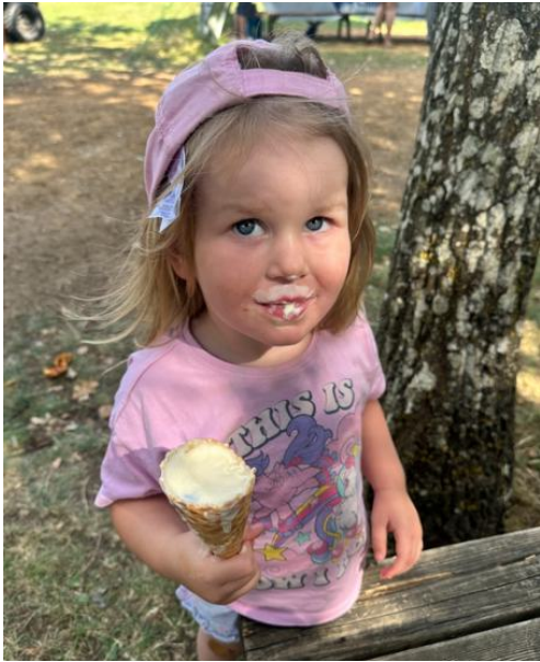
Ice Cream parlour