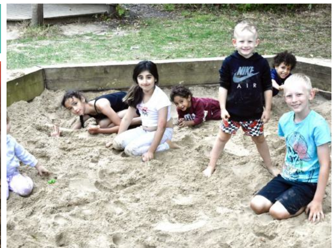
Rounders, and much more...