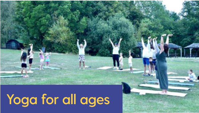
Yoga for all ages